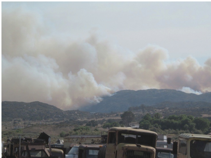
Smoke from the wildfire billows over the hills east of the Campo Mill. Known as the "Border Fire" it destroyed 5 homes and 11 outbuildings.

On June 19 th a fire started along the border of Mexico in the community of Potrero located 9 miles southwest of our museum. Due to undesirable wind conditions it rapidly consumed 7,609 acres of mountainous brush and along its path entered our museums community of Campo. The fire caused