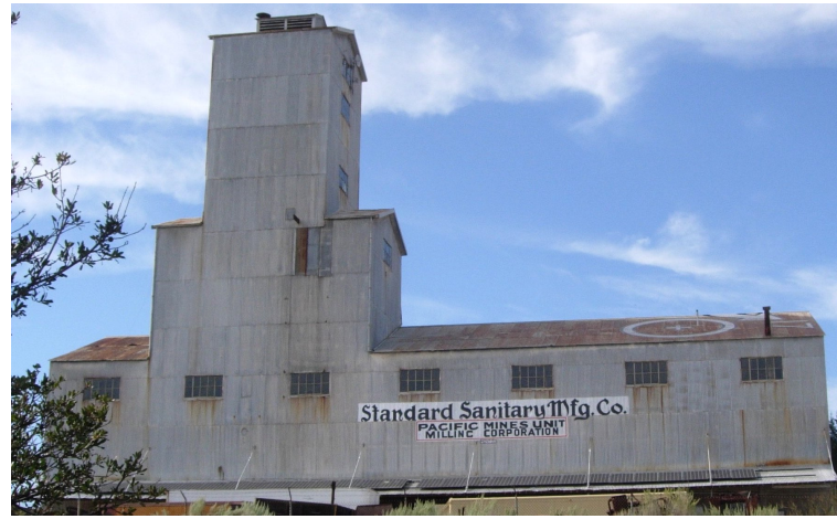
The sign painted on the South side of the Mill. The building is a steel frame with corrugated galvanized sheet steel siding.

The company painted a sign on the south side of the Mill, facing the railroad siding where the cars were loaded. Through