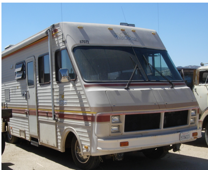
The MTM thanks these donors for their generosity in helping the Museum to attain its goals