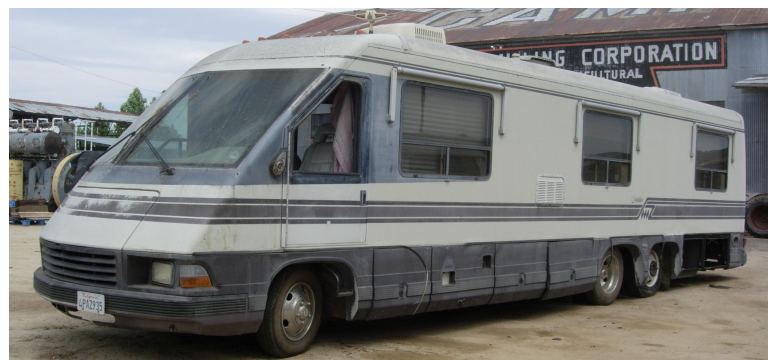
The 1987 Triple E motorhome donated by Sandra Suten.

The Motor Transport Museum accepts donations of vehicles, tools, literature and miscellaneous items. The Museum is a 501 (c) (3) charitable organization and all donations are