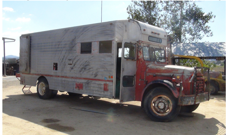
Barefoot Jim's donated 1952 GMC 740 modified Cargo Van and living habitat.

The GMC 740 originally had a diesel engine, but according to a metal tag placed on the side of its 604 straight six gas engine: " This engine has been balanced completely as an experiment. Please leave this tag on engine 3-28-62 N.P.T. Billing ". The cargo hold had also been converted into a living